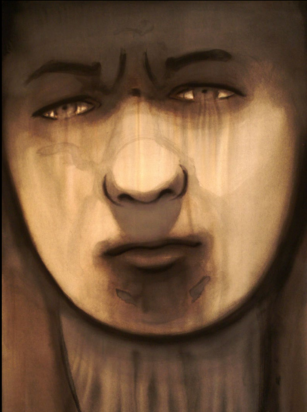
Women with HIV Series Nos. 1-44, 4