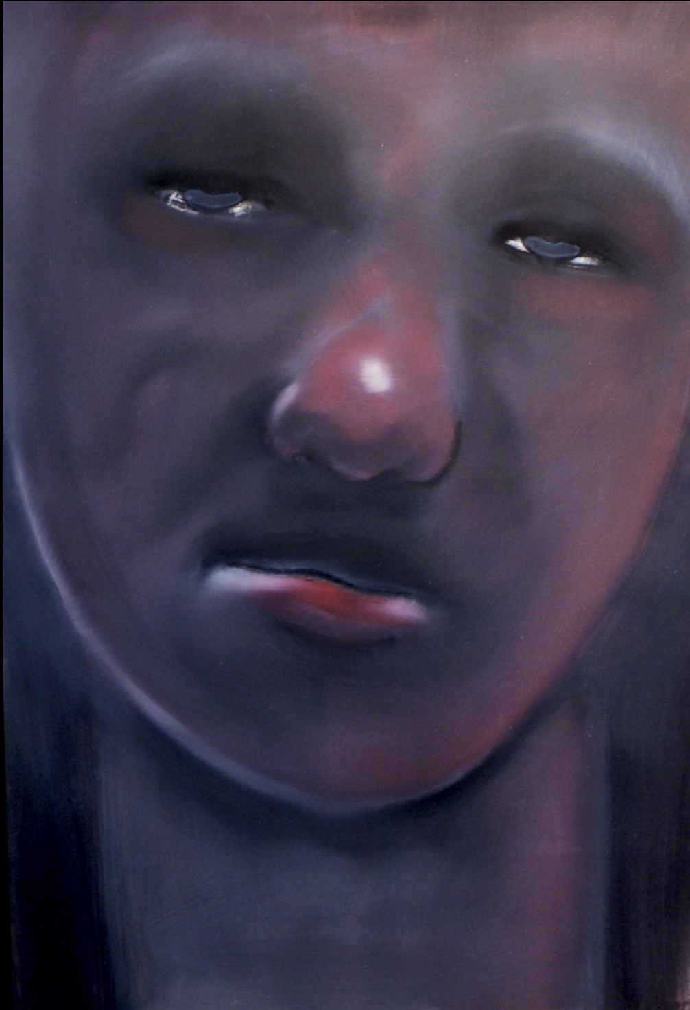
Women with HIV Series Nos. 1-44, 29