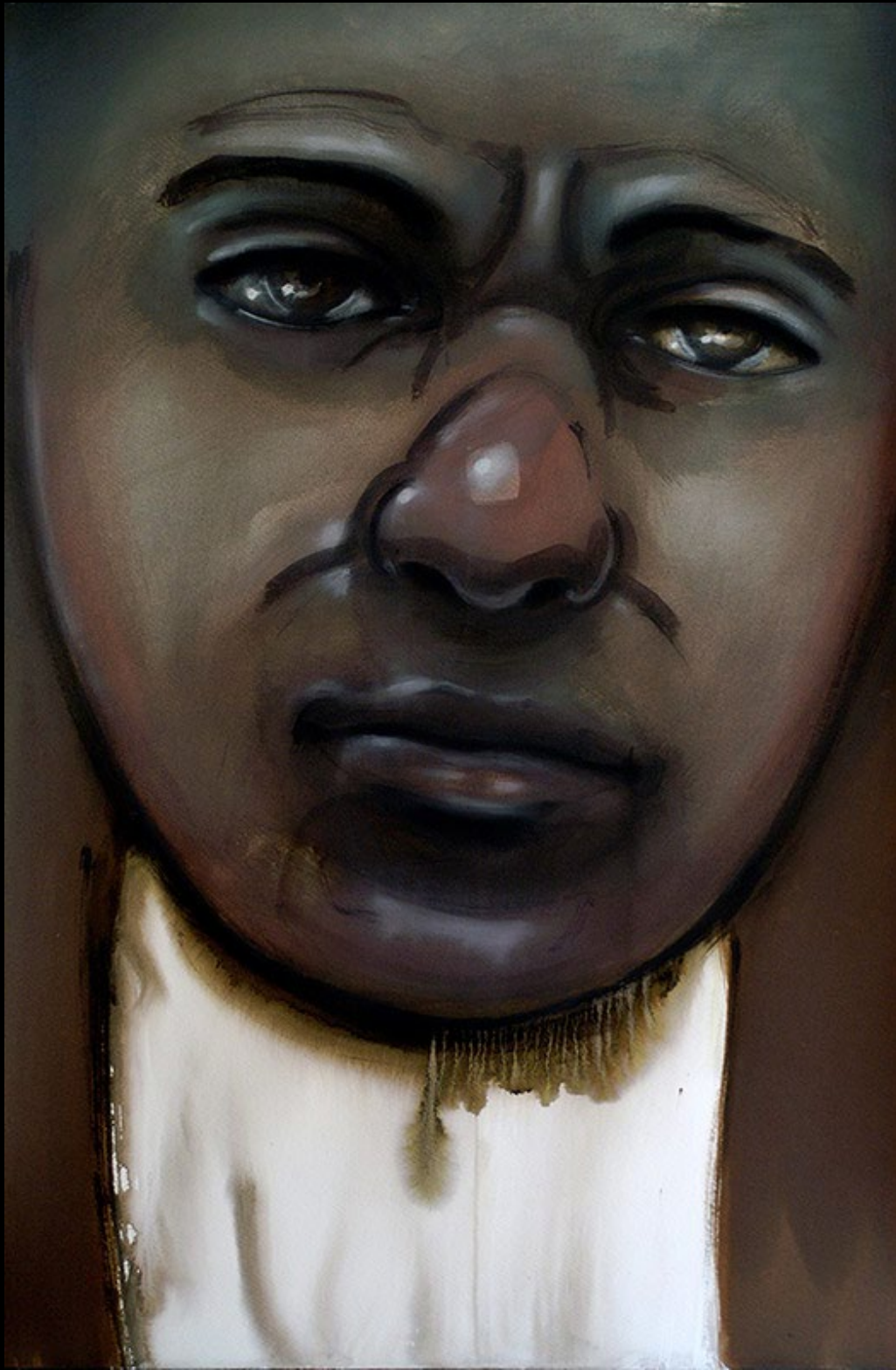
Women with HIV Series Nos. 1-44, 2

2006-08 acrylic and ink on paper 76cm x 112cm