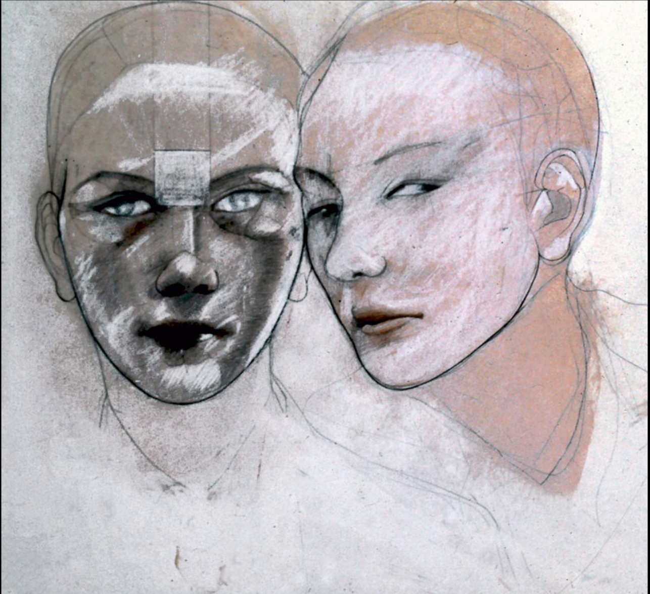
Drawings 1978-84 Two Heads (1979)

1979 chinagraph, pencil and pastel 40cm x 40cm