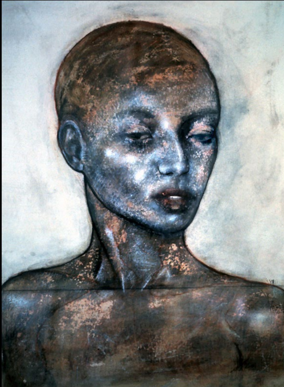
Drawings 1978-84 Head and Shoulders Above Water

1978-79 pencil, chinagraph, chalk, acrylic and ink 85cm x 110cm