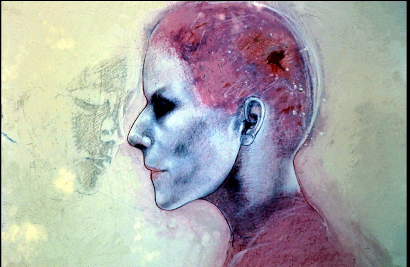
Drawings 1978-84 Two Heads (1978)

1978 chinagraph, ink, pencil and pastel on card 100cm x 70cm